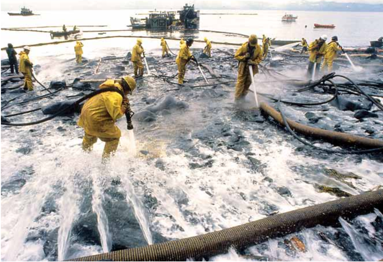
Exxon Valdez Oil Spill Trustee Council